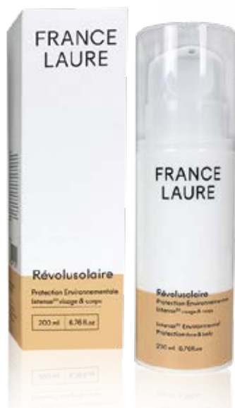
ENVIRONMENTAL PROTECTION INTENSE 50 face & body

Size: 200ml / 6.76fl.oz Product code: 101521 PRICE: $56,50