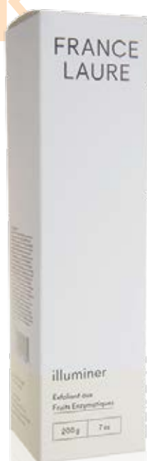
ENZYMATIC FRUIT EXFOLIANT illuminate

Size: 200g / 7oz Product code: 112013 PRICE: $64,10