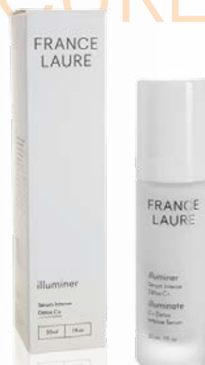
CURE I C+ DETOX INTENSE SERUM illuminate

Size: 50g / 1.75oz Product code: 104032 PRICE: $64,60