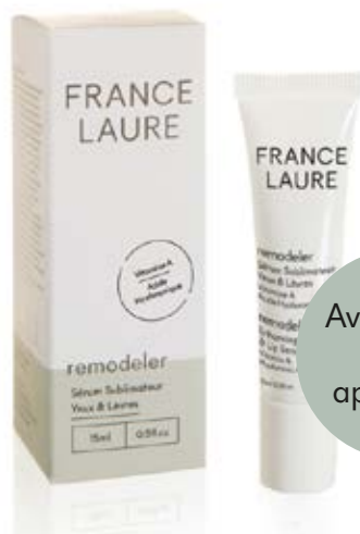
ENHANCING EYE & LIP SERUM remodel

Size: 15g / 0.5oz Product code: 303020 PRICE: $64,60