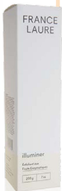
ALMOND GRAIN EXFOLIANT illuminate

This mechanical exfoliant removes dead cells, stimulates cell renewal and activates blood circulation for a soft and healthy skin.