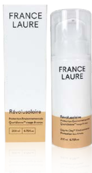
ENVIRONMENTAL PROTECTION DAY-TO-DAY 30 face & body protect

Protects from environmental aggressions, maintains the hydrolipidic balance and fights photo-aging. Without perfume, hypoallergenic, face and body formula.