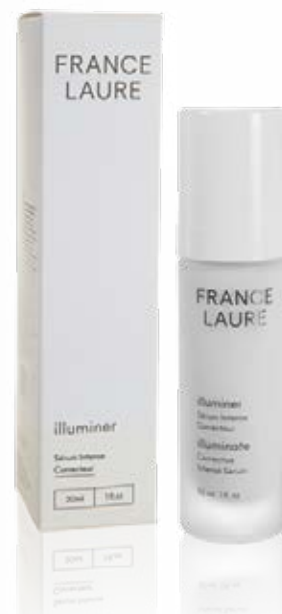
CORRECTIVE INTENSE SERUM illuminate

Size: 30ml / 1fl.oz Product code: 708022 PRICE: $86,20