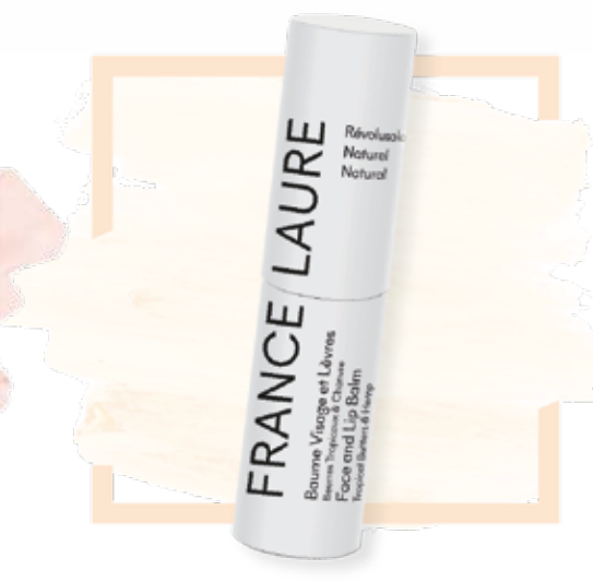
FACE AND LIP BALM natural REVOLUSOLAIRE 10 Suitable for the whole family

Size: 10g Product code: 101505 PRICE: $20,50