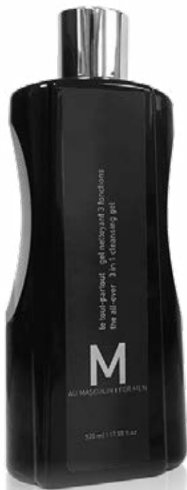
CLEANSING GEL ALL-OVER M | for men

This all-in-one shower gel for face, body and shaving, removes impurities, oxygenates the skin and balances skin pH.