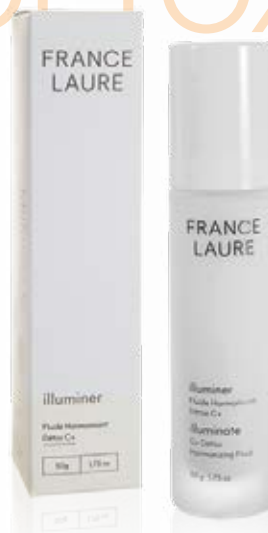
CURE I C+ DETOX HARMONIZING FLUID illuminate

Size: 50g / 1.75oz Product code: 104012 PRICE: $64,60