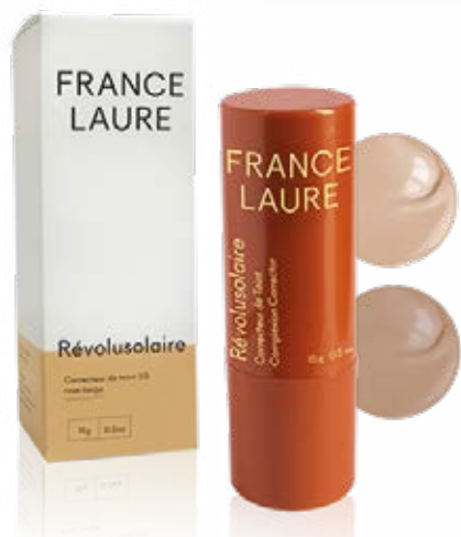
COMPLEXION CORRECTOR 30 PINK-BEIGE OR DARK BEIGE protect

Protects from external aggressions and fights against premature aging of the skin. Hides imperfections. Leaves a silky powdery finish. Hypoallergenic, water and sweat resistant. Available in two tones, pink-beige and dark beige