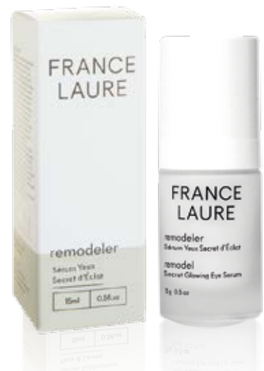
SECRET GLOWING EYE SERUM remodel

The eye area is delicate and conducive to aging. Therefore, this serum meets four mains goals : - Concealer/brightening - Intense moisturizing - Anti-aging - Anti-inflammatory/anti-puffiness Ideal as a make-up base or as a daily care, its light and smooth formula penetrates quickly and restores radiance, tone and firmness to your eyes.