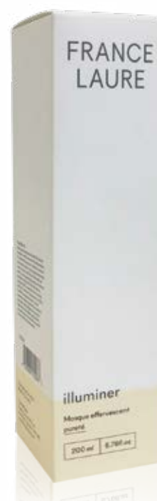
PURITY EFFERVESCENT MASK illuminate

Size: 200g / 7oz Product code: 112062 PRICE: $70,00