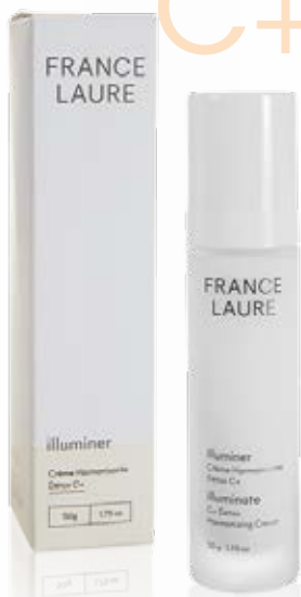
CURE I C+ DETOX HARMONIZING CREAM illuminate

Size: 50g / 1.75oz Product code: 103022 PRICE: $107,70