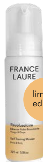
SELF-TANNING MOUSSE face & body

Size: 200ml / 6.76fl.oz Product code: 101523 PRICE: $41,00