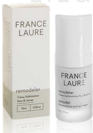
ENHANCING EYE & LIP CREAM remodel

This cream treats wrinkles, fines lines, it firm and brightens eye complexion. Treats the fragile outline of the eyes and lips.