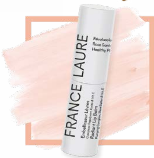
RADIANT LIP BALM healthy pink REVOLUSOLAIRE 10 protect

Size: 15g / 0.5oz Product code: pink-beige 101501 Product code: dark beige 101502 PRICE: $43,00/ch.