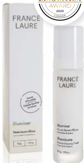
SECRET GLOWING FLUID DAILY CARE illuminate

Perfect to fight the effects of pollution, stress and screens blue light. This light-textured daily fluid provides immediate comfort and radiance. Suitable for all skin types.