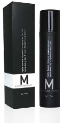
HYDRA-BALM DAY & NIGHT FACIAL MOISTURIZER M | for men

Size: 520ml / 17.58fl.oz Product code: 707012 PRICE: $48,40