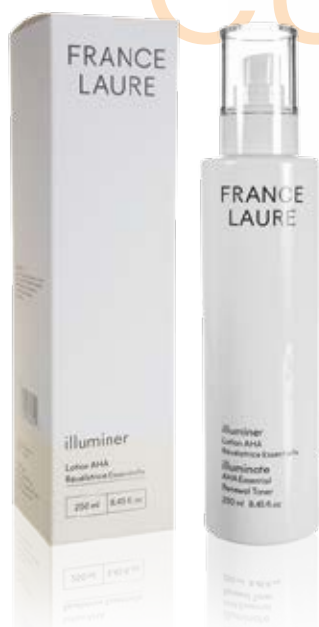
AHA ESSENTIAL RENEWAL TONER illuminate

This fruity smelling lotion is used for a punctual treatment. Combined with the AHA Essential Renewal Serum, it stimulates epithelial renewal and provides gradual exfoliation of the skin. Combined with Corrective Intense Serum, it brightens and unifies the complexion.