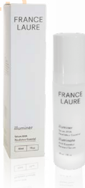
AHA ESSENTIAL RENEWAL SERUM illuminate

Size: 250ml / 8.45fl.oz Product code: 708012 PRICE: $97,00