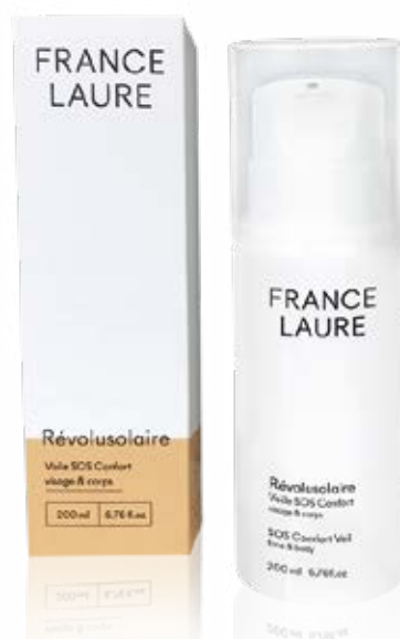
SOS COMFORT VEIL face & body protect

Size: 200ml / 6.76fl.oz Product code: 101522 PRICE: $59,30